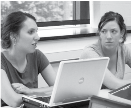
Students in Children's Clinic class

time from among those turned over to the Franklin County Public Defender's Office. "I've gotten fairly good at reading criminal complaints and having an idea where the case may go," he said.