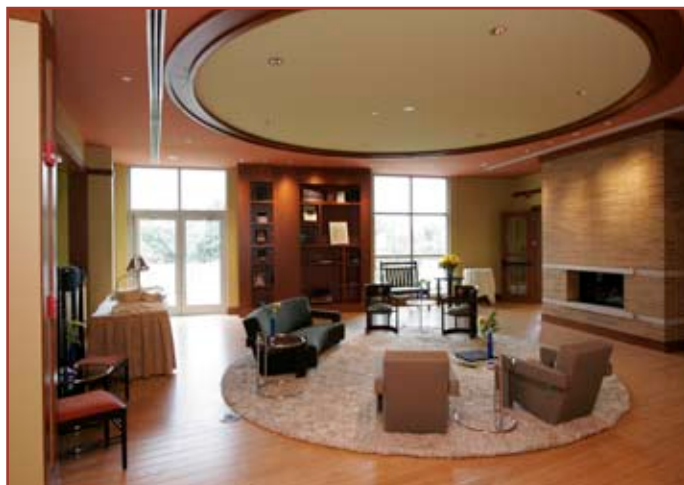
Porter, Wright, Morris & Arthur Lounge Chester Willcox & Saxbe LLP Terrace

Our goal at The Ohio State University's Moritz College of Law is to create one of the nation's best learning environments – a vibrant, stimulating community in which our students are continuously challenged to push their analytical reach, and every graduate is equipped to master complex intellectual challenges with professionalism and integrity.