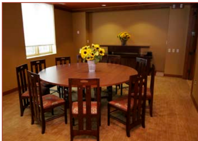
Vorys, Sater, Seymour and Pease LLP Conference Room

For Moritz Law, the creation of apartments for law students and the Barrister Club generates new learning opportunities and an exciting law campus within The Ohio State University. We thank you for coming to Judges' Day at the Barrister Club and encourage you to return often to experience first-hand our community of scholars.