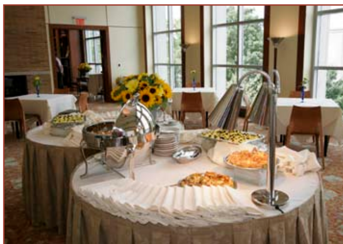
Baker & Hostetler Dining Room

The Barrister Club is the site of an innovative mentoring program that places Moritz students in relationships with practicing attorneys and jurists whose careers reflect the highest ideals of the profession. Mentors, faculty, and students come together to hear nationally-recognized speakers and engage in discussions and debate that illuminate current ethical, political, and social issues here and around the world.